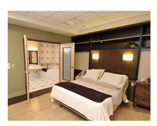
Family Care Unit